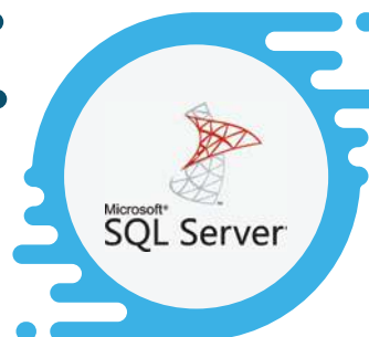
Microsoft SQL Server